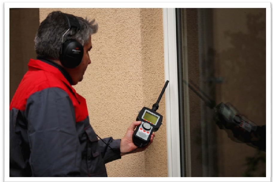
with the product Sonaphone T