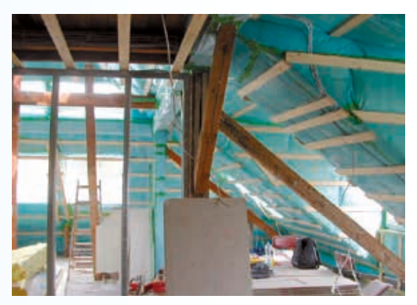
The air barrier is still visible (sheets and wood panels): This is the optimum time for a BlowerDoor measurement.

the valid standards (EN 13829, ISO 9972). Via the BlowerDoor fan, air is continuously sucked out of the building, so that an imperceptible negative pressure of 50 Pascal is generated within the building. Occupants can remain in the building during the measurement without experiencing any discomfort. If there are leakages in the building envelope, outside air will infiltrate the building through them. During the walkaround, the building is carefully inspected for air flows which are located by means of an anemometer or via IR thermography.