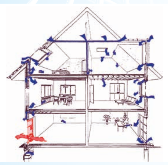
The measuring principle: A fan draws the air out of the building. Outside air flows into the building through any leaks.

The Minneapolis BlowerDoor has been used for air tightness measurements in Germany since 1989 and is today one of the most successful testing devices for air tightness worldwide. IR thermography during the BlowerDoor measurement optimally completes the test of the building envelope, delivering comprehensive results and conducive evidence of the condition of the building envelope. These conclusions are illustrated and documented within the quality assurance process.