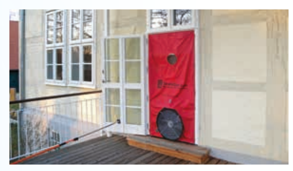
BlowerDoor measurement in the context of an energetic renovation