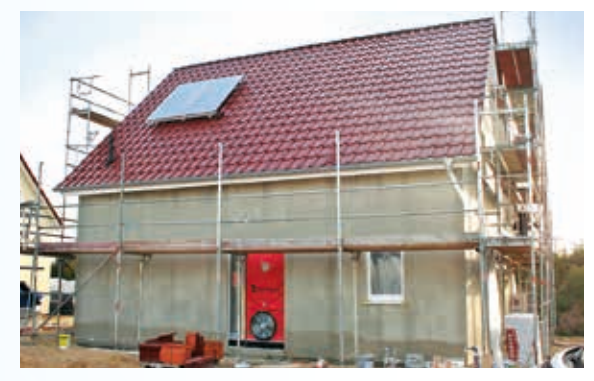
BlowerDoor test of a new single-family home

A building is considered airtight when the air in the building under testing conditions is not exchanged more than three times per hour. In a building equipped with a ventilation system, the air change at testing pressure cannot exceed 1.5 times per hour. "Airtight" thus does not mean completely sealing a building, but rather avoiding undesired leakages in the building envelope. This is important because warm air flowing out through the joints costs energy. At the same time, the warm air transports moisture. It cools at the outside wall of the building and condenses. This condensation can cause severe structural damage. Outside air infiltrating the building through joints also transports allergens from the insulation and dust particles into the house, which can lead to ill effects on the occupants' health.