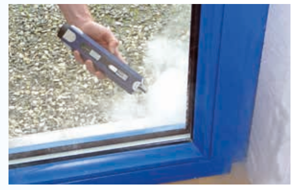
Leakage detection with the fog generator BlowerDoor HandFogger

Construction-related leakages or permeability often occur at connections and penetrations. When planning an air barrier, these areas should be given careful consideration to avoid costly rework later.